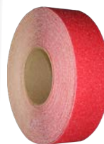
15- SAFETY RED