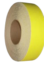
08- SAFETY YELLOW