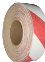
18- RED/WHT HAZARD