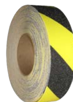
17- BLK/YL HAZARD