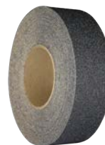
02- SC BLACK