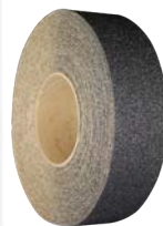
STANDARD 19- BLACK

Ideal for converters because we understand the need for product consistency and quicker lead times. Not only do we offer a higher quality AMERICAN MADE anti-slip tape product, we manufacture a wide variety of bulk rolls at affordable costs. Sure-Foot offers anti-slip bulk rolls ranging from 25 to 52 inches wide and lengths up to 500 feet. In addition to variety, we are proud to offer quick lead times for your projects. We offer competitive pricing allowing you to be more successful.