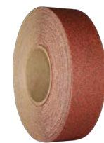
04- BRICK RED