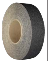
14- HD BLACK