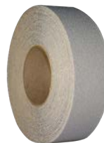
28 - GREY