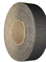
27 - BLACK