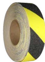
17 - BLK/YL HAZARD