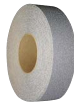
03 - GREY