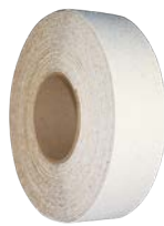
01 - WHITE