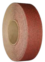
04 - BRICK RED