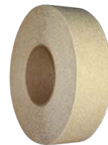
07 - BEIGE