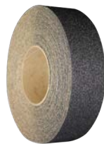
STANDARD 19 - BLACK

Varieties of grit materials, colors and sizes are available to meet specific needs. All tapes and treads meet and exceed OSHA and ADA recommendations for slip resistance. Master Stop Safety Tapes and Treads are made with a mineral abrasive grit-coated polyester film to provide maximum traction. The pressure sensitive adhesive backing with removable liner offers the versatility to be applied in both interior and exterior applications.