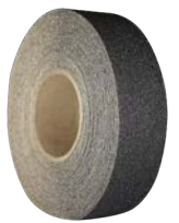
14 - HD BLACK