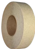
05 - CLEAR