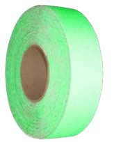
50 - GLOW