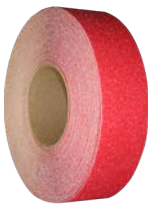
15 - SAFETY RED