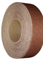
06 - BROWN