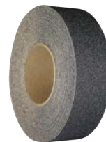
02 - SC BLACK